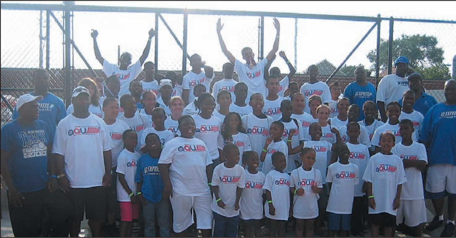
Members of the Lee County Express Track Club attended the Junior Olympics competition held in Greensboro, NC earlier this summer.